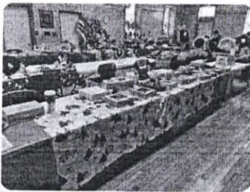
Craft Vendors all set up for the Christmas Craft Fair

Thanks to the enthusiastic participation of local artisans, community members, and volunteers, the craft fair proved to be a vibrant celebration of creativity and community spirit. Vendors offered a wide variety of handmade goods, and attendees enjoyed browsing unique items, connecting with neighbors, and supporting an important local cause.