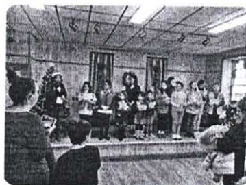
Our Local Girl Scout Troups are caroling to get their badge.